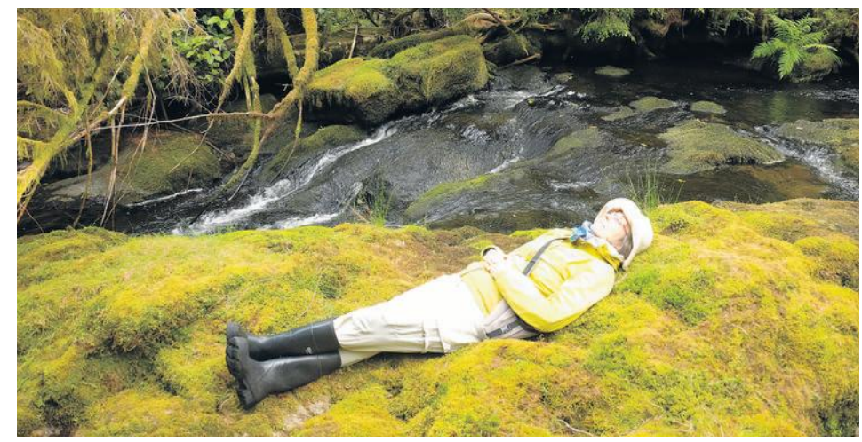
The author rests on a bed of moss in the national park forest.

Fortunately for them — and us — the Haida won that battle, which led to the creation in 1993 of the park reserve, Haida Heritage Site and National Marine Conservation Area. which, together, cover the southern third of this dagger-shaped archipelago.