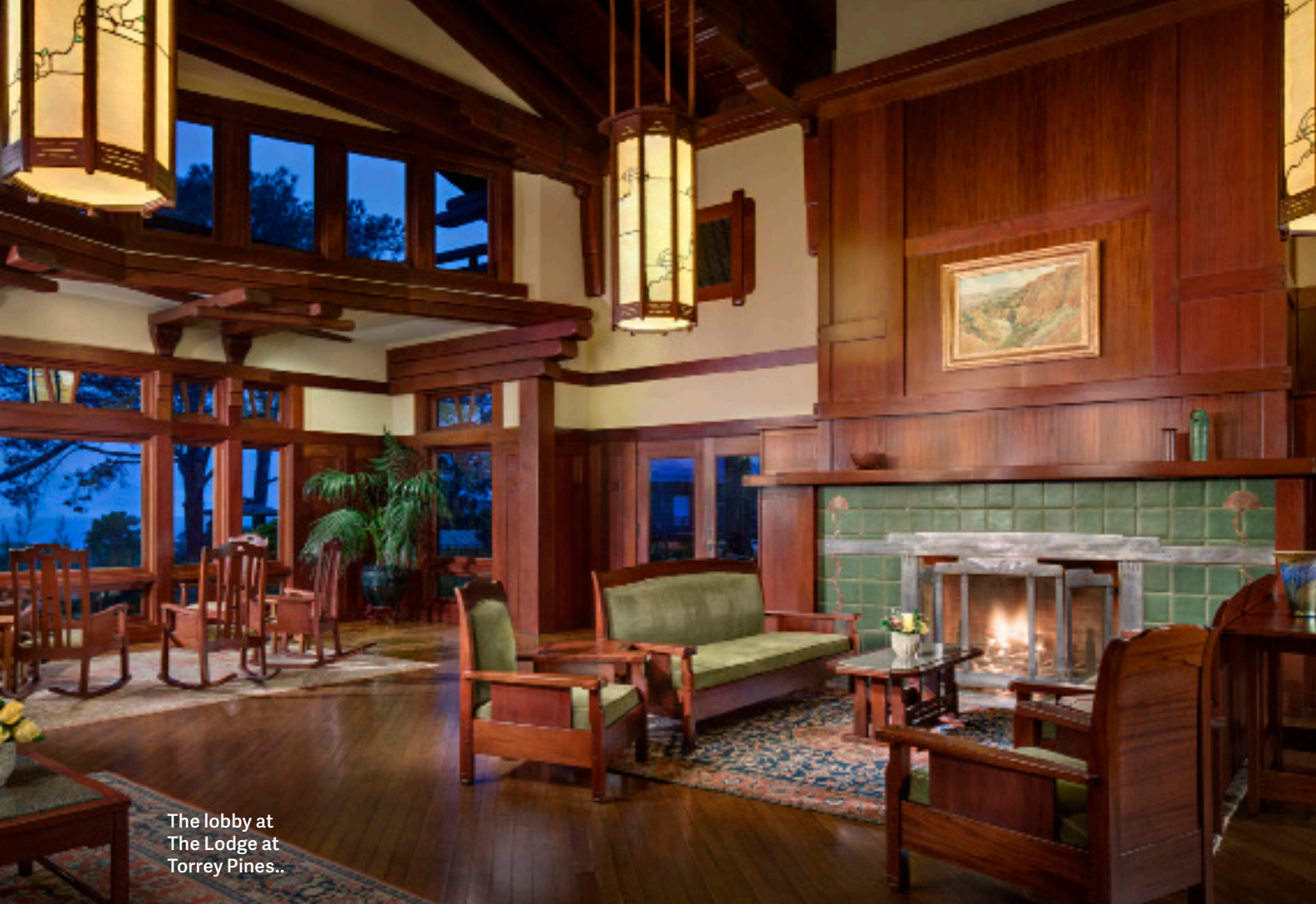
The lobby at The Lodge at Torrey Pines..

How easy and luxurious it would be to spend three days without leaving this place; swimming in the outdoor pool with classical music playing underwater, joining a yoga class or two, enjoying treatments in the spa, even playing croquet on the expansive lawn.