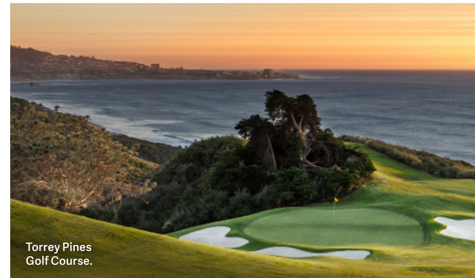
Torrey Pines Golf Course.

How easy and luxurious it would be to spend three days without leaving this place; swimming in the outdoor pool with classical music playing underwater, joining a yoga class or two, enjoying treatments in the spa, even playing croquet on the expansive lawn.