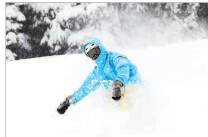
Winter Park Resort

Get a second night for half price when you book one night at a Winter Park property through Dec. 20.