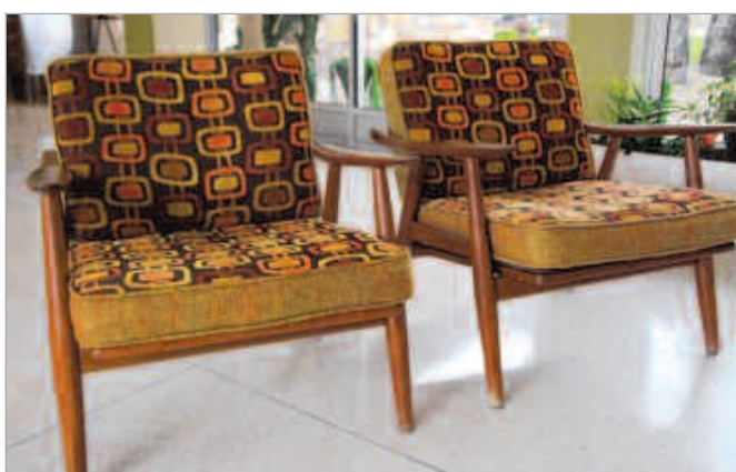
Vintage furniture decorates the lobby and each of the rooms at the Del Marcos Hotel.