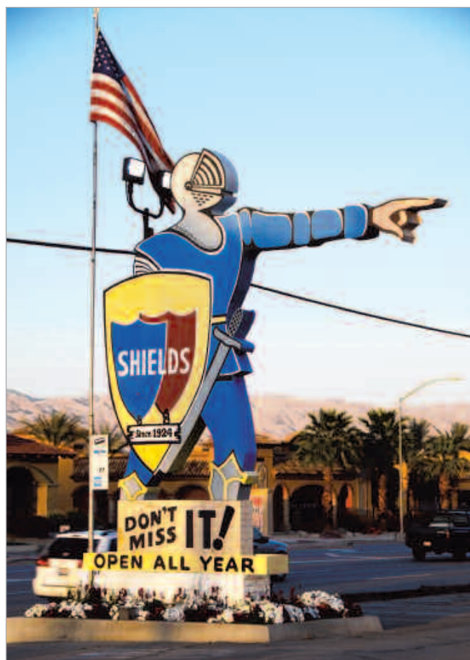
Shields Date Garden has been in business for almost 90 years. A date shake is a great way to refuel.