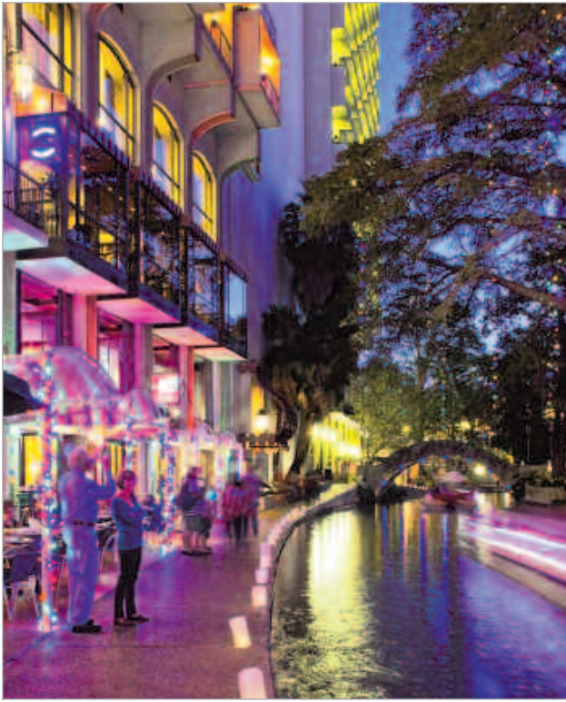
San Antonio Convention and Visitors Bureau

The sidewalks of San Antonio's River Walk will be lined with traditional Mexican luminarias on weekends starting Dec. 6 during the Fiesta de las Luminarias.