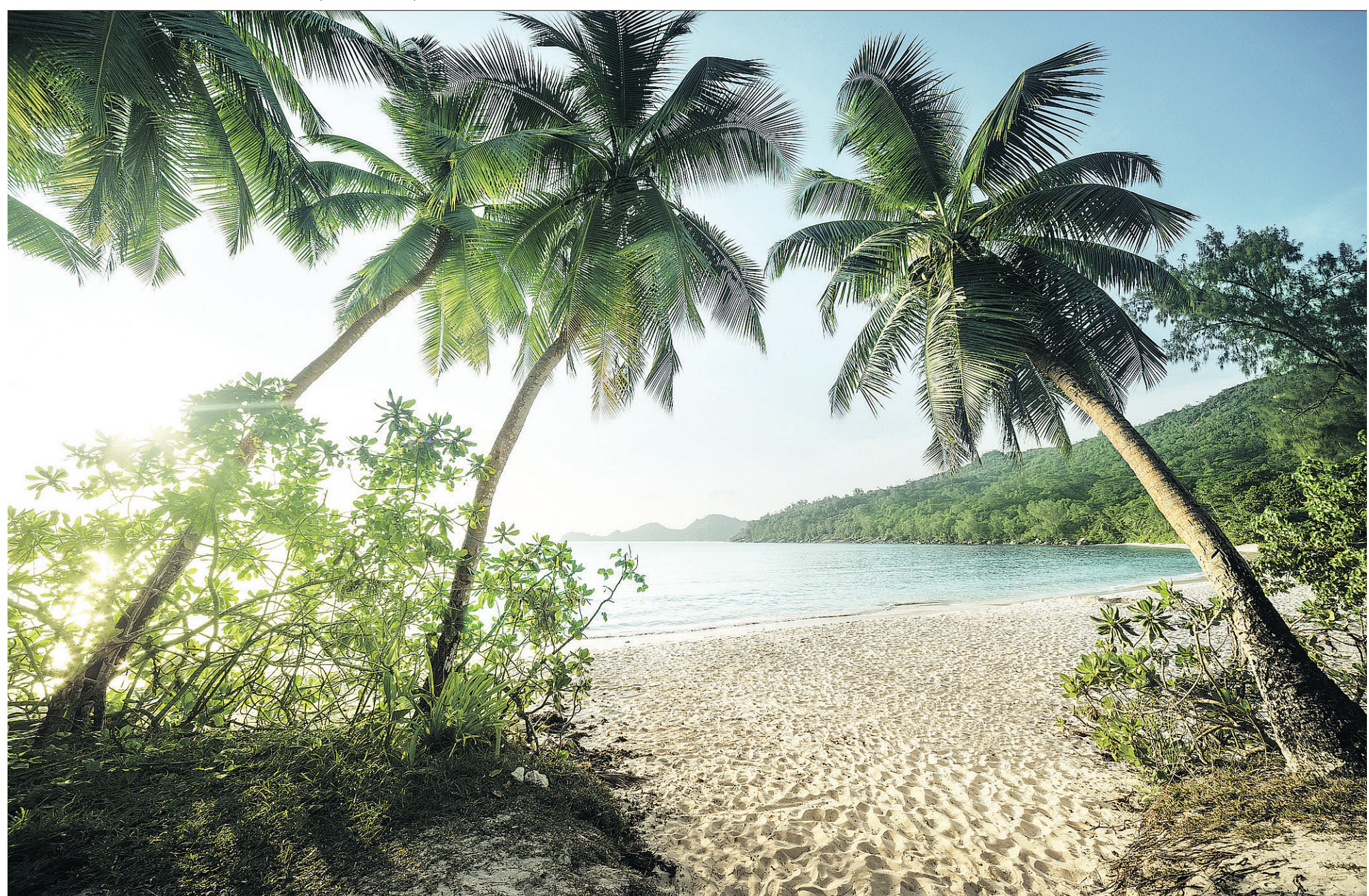
Seychelles is nothing less than another Galapagos, with wondrous plants and animals — species you won't find anywhere else, writes Suzanne Morphet.