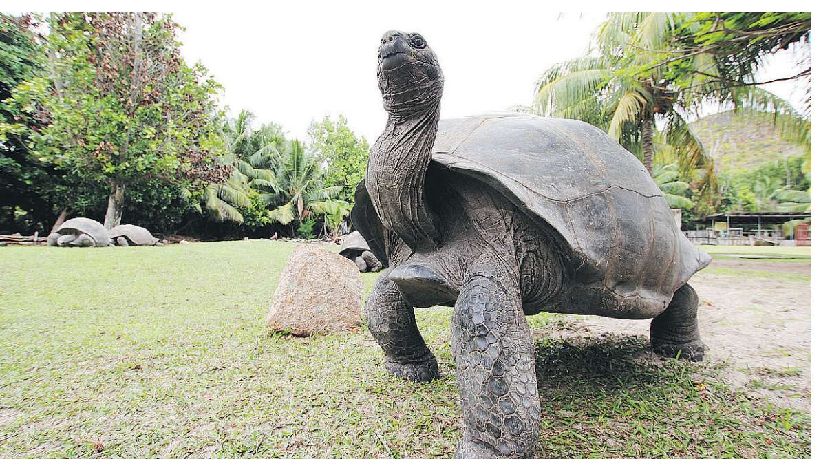
There are more turtles than people in Seychelles. The Aldabra Giant Tortoise is the biggest species.

Then I happened to pick up an issue of National Geographic with an article entitled Return to Seychelles. I learned these islands offer far more than gorgeous beaches. They're nothing less than another Galapagos, with wondrous plants and animals - species you won't find anywhere else. Seychelles,