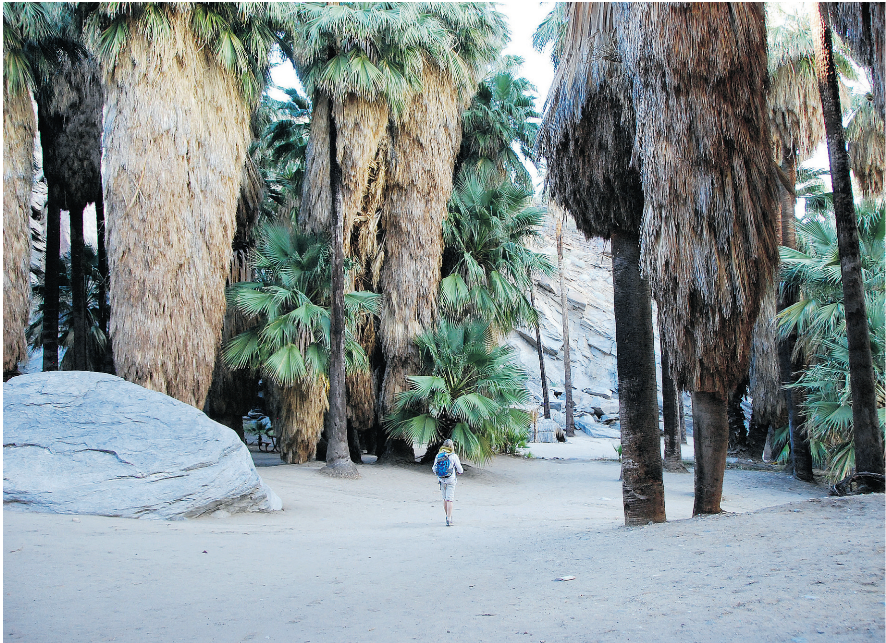
A hiker is dwarfed by towering fan palm trees at the Lower Palm Canyon oasis in Palm Springs' Indian Canyons. Fan palms ( Washingtonia filifera ) are native to the Southern California desert and once provided food and shade to the local indigenous people.