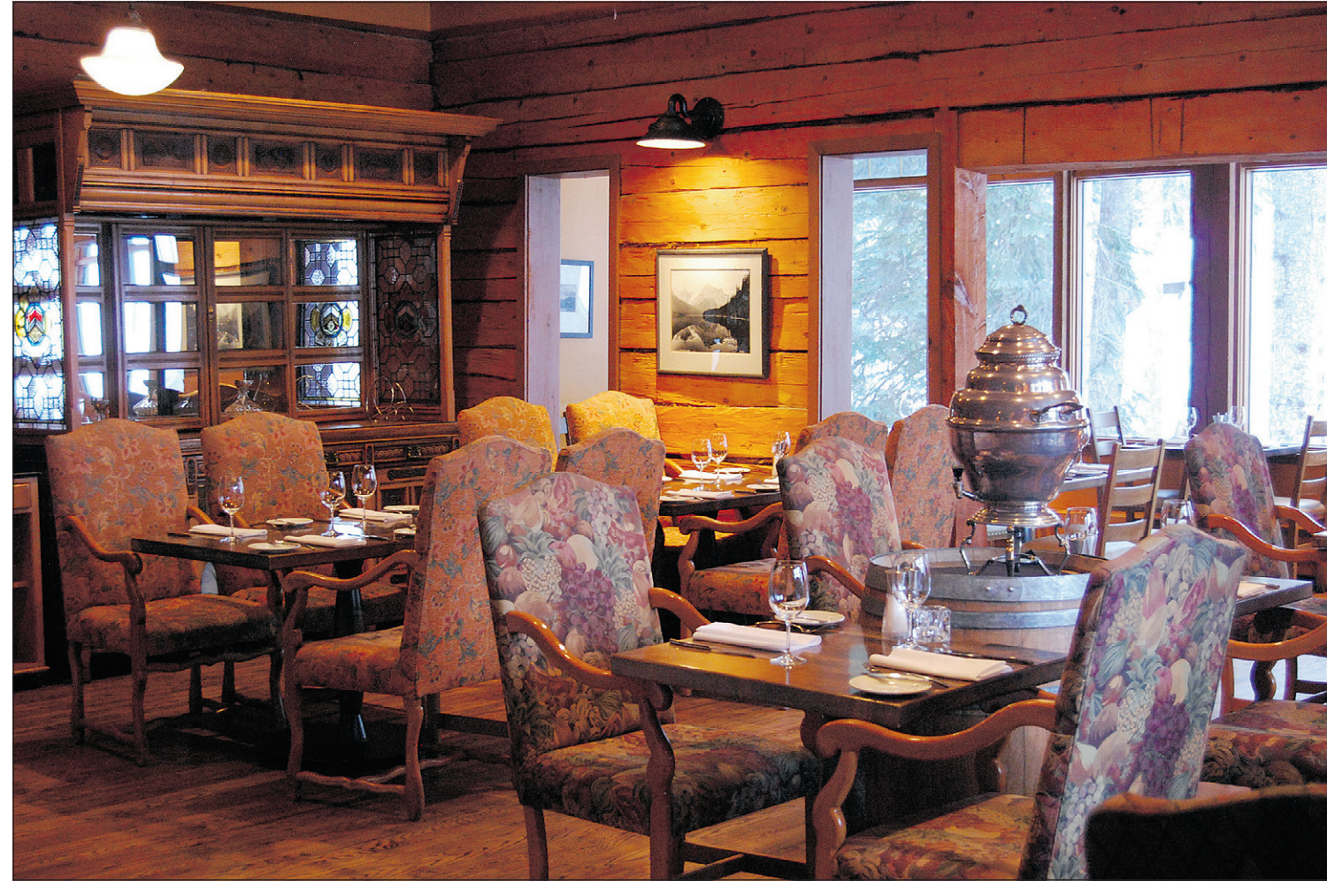
Emerald Lake Lodge's Mt. Burgess dining room was ranked in the '101 Best Hotel Restaurants Around the World' by The Daily Meal.