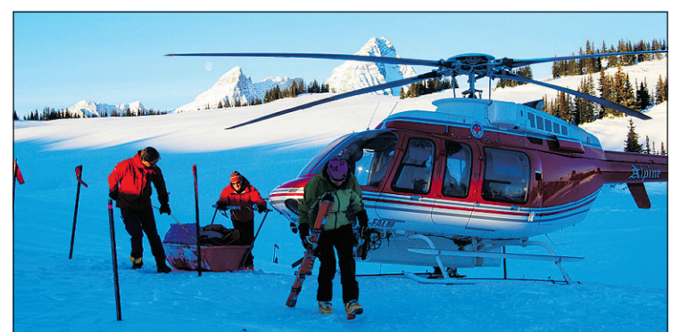
A spectacular 15-minute helicopter flight from Golden takes you to the Purcell Mountain Lodge 'in the middle of nowhere.'