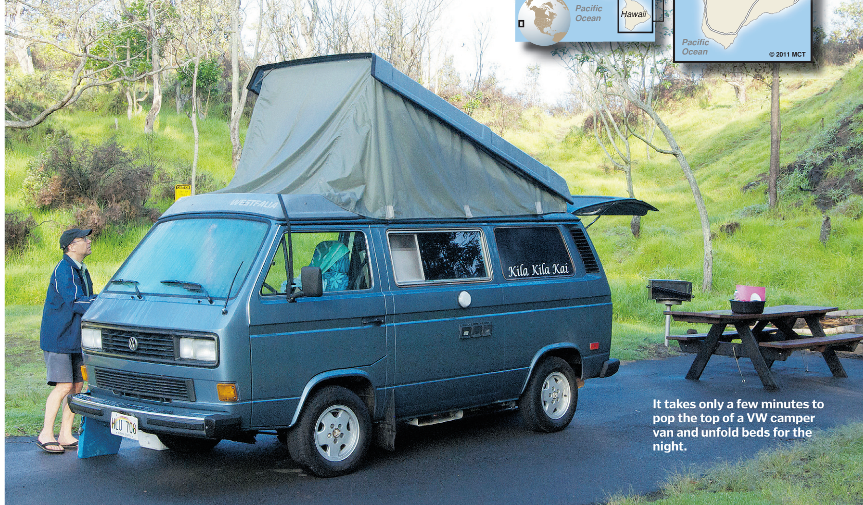
It takes only a few minutes to pop the top of a VW camper van and unfold beds for the night.