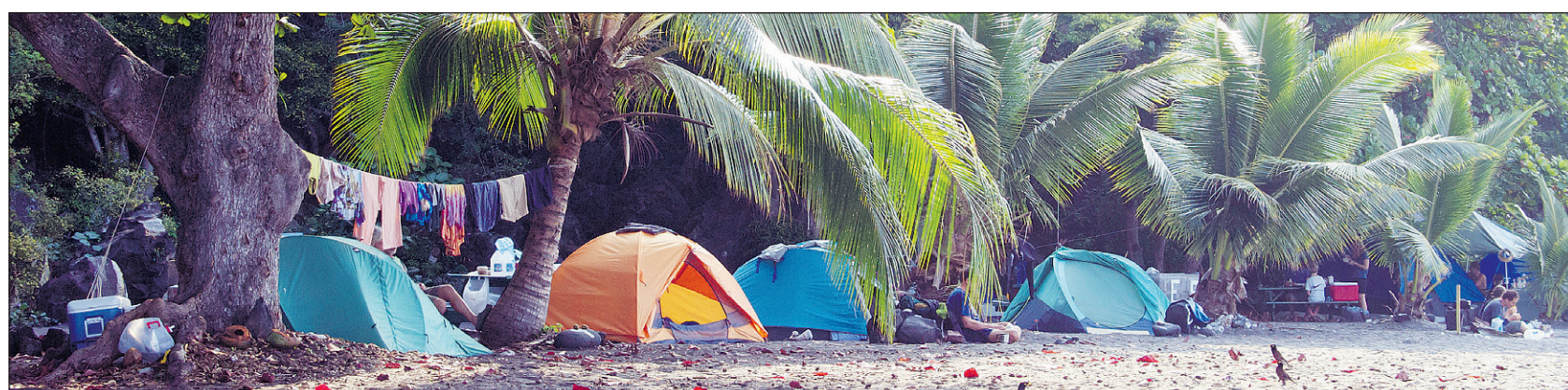
Ho'okena Beach Park, 20 kilometres south of where Captain Cook was killed by Hawaiians in 1779, is now managed by the local community and is a popular campground for visitors. Tents can be set up right on the sand, while campervans park at one end of the beach.