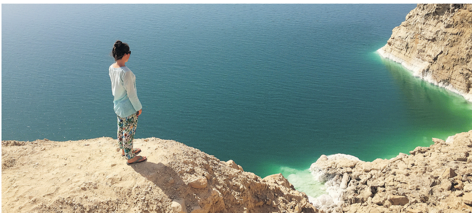
The Dead Sea is receding by about one metre per year.

Our tour ends at the Dead Sea, just down the road from the waterfalls of Wadi Mujib. Wrapped in mud — a signature spa treatment here — I ponder all we've seen and done. The writer was a guest of the Jordan Tourism Board. It did not review or approve this story.